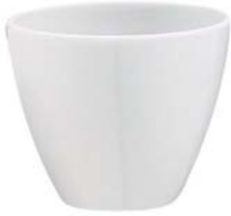
17803-08 Crucibles, high-form, porcelain, autoclavable, Coors Ceramics Company, 30 mL, 43 mm top OD, 37 mm H, pk of 12