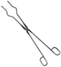
06443-50 Crucible tongs, nickel-plated steel