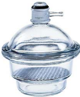
08912-40 Dry-Seal Glass Vacuum Desiccator, 140 mm plate size