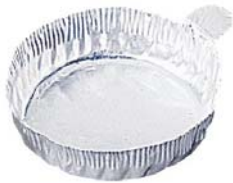
01017-50 Disposable Aluminum Weigh Dish (case of 1000)